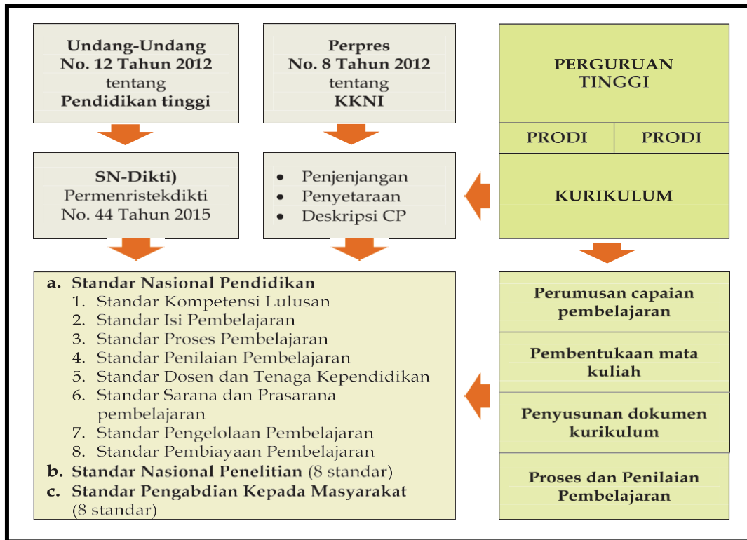
Figure 1. Reference for Developing Higher Education Curriculum